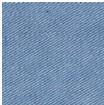
03761.001 LIGHT BLUE