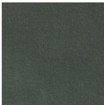
04311.002 METALLIC GREEN/ BLACK