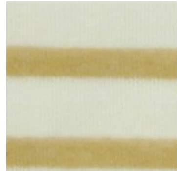
03930.013 ECRU / SAND