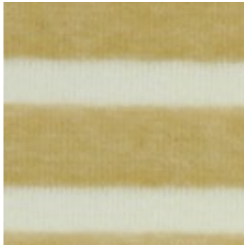
03930.003 SAND / ECRU