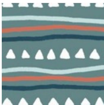
09935.018 BLUE SHADOW