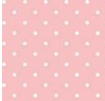
C4948.012 OLD ROSE