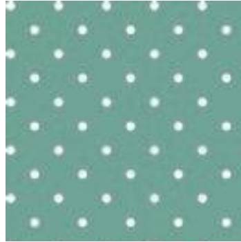
C4948.029 OLD GREEN