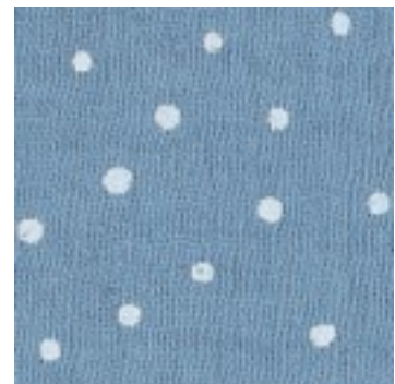
04671.020 LIGHT BLUE