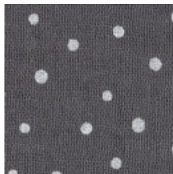
04671.022 DARK GREY