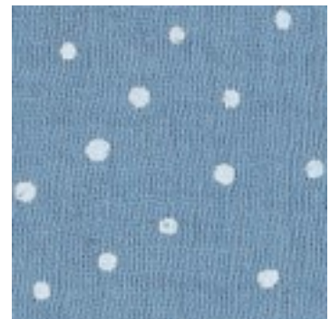
04671.020 LIGHT BLUE