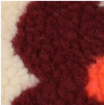
03716.001 BEIGE/WINE RED