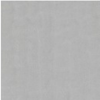
03959.022 LIGHT GREY