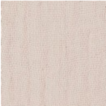
03959.021 LIGHT ROSE