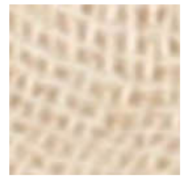
03959.025 LIGHT SALMON